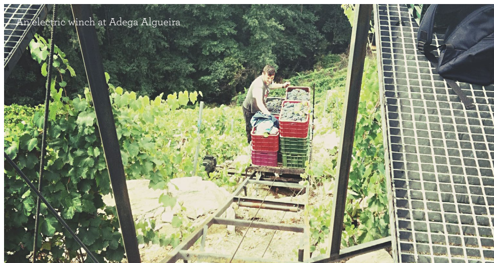
An electric winch at Adegas Algueira

And beyond this, Lucia explains, “It improves the quality of our viticulture, since we don’t rely on machines which don’t have the same sensitivity as hands, eyes or feet. We carry out a very ‘human’ viticulture, a mentality that extends into the winery – crushing the grapes with our feet in wood barrels, with a very patient control over the fermentation process. It’s hard, absolutely, but the feeling we get when we have the bottle in our hands at the end of the process makes this whole adventure worth it.”