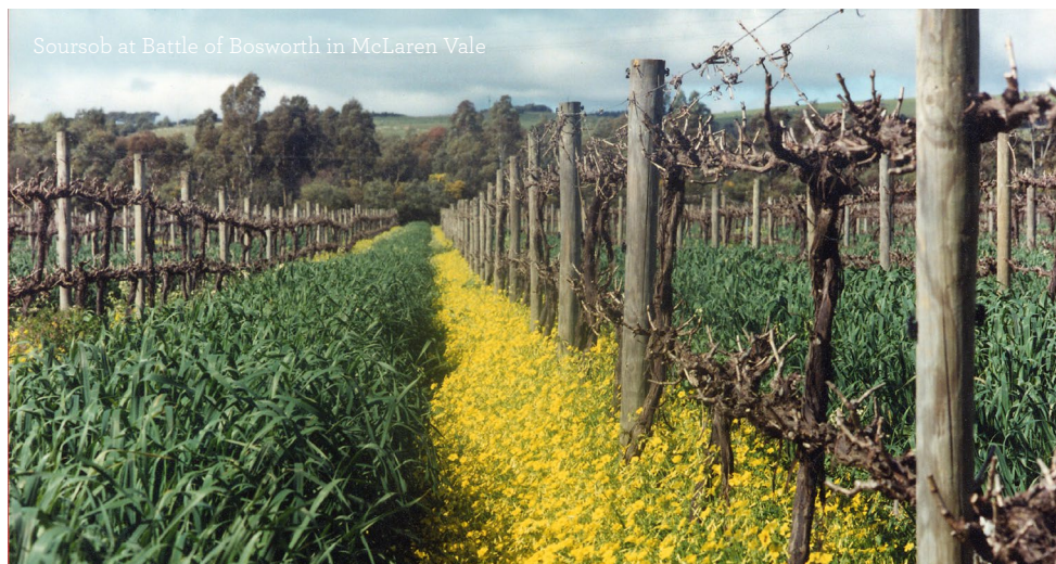
Soursob at Battle of Bosworth in McLaren Vale