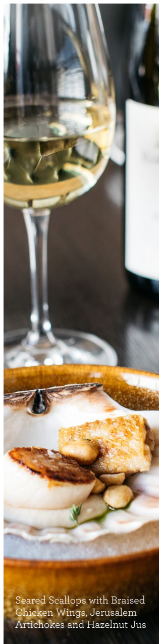
Seared Scallops with Braised Chicken Wings, Jerusalem Artichokes and Hazelnut Jus