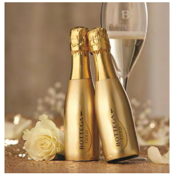
BOTTEGA Gold • VENETO, ITALY • 20cl | 11.5% Abv

Bottega Rose Gold is a Brut rosè sparkling wine made with Pinot Noir grapes from Lombardy. An intense and elegant bouquet. Characterized by floral and fruity notes, mainly mixed berries and wild strawberries.